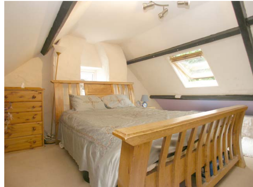
Master attic bedroom

All fitted floor coverings, curtains, blinds, light fittings, all fitted units and appliances as listed.