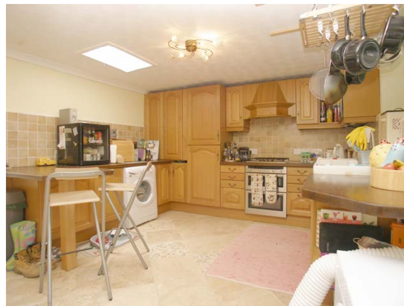
Kitchen - breakfast room

Window to rear with curtain pole, curtains with rural outlook. Wall lighting. Radiator. Carpet. Fitted storage units. Phone point. Open plan stairs to:-