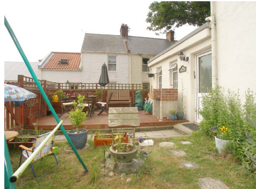
Enclosed front garden and decked area