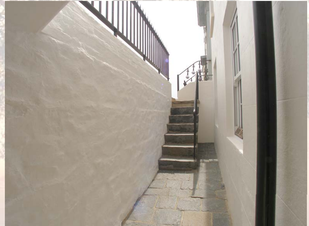
Steps to front door